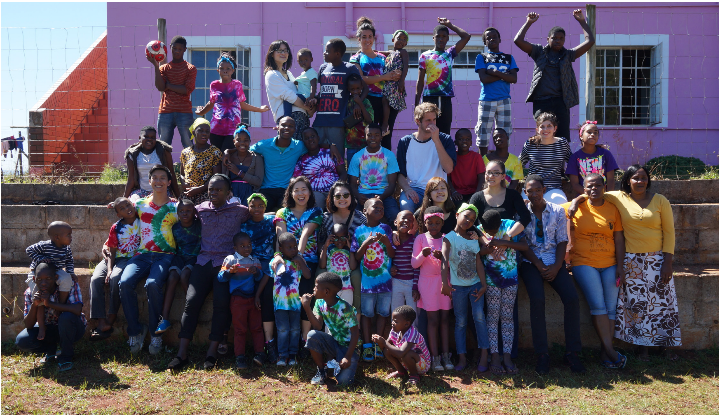
Finished tie dye shirts in action! Learn more about iKhethelo at www.ikhethelo.org