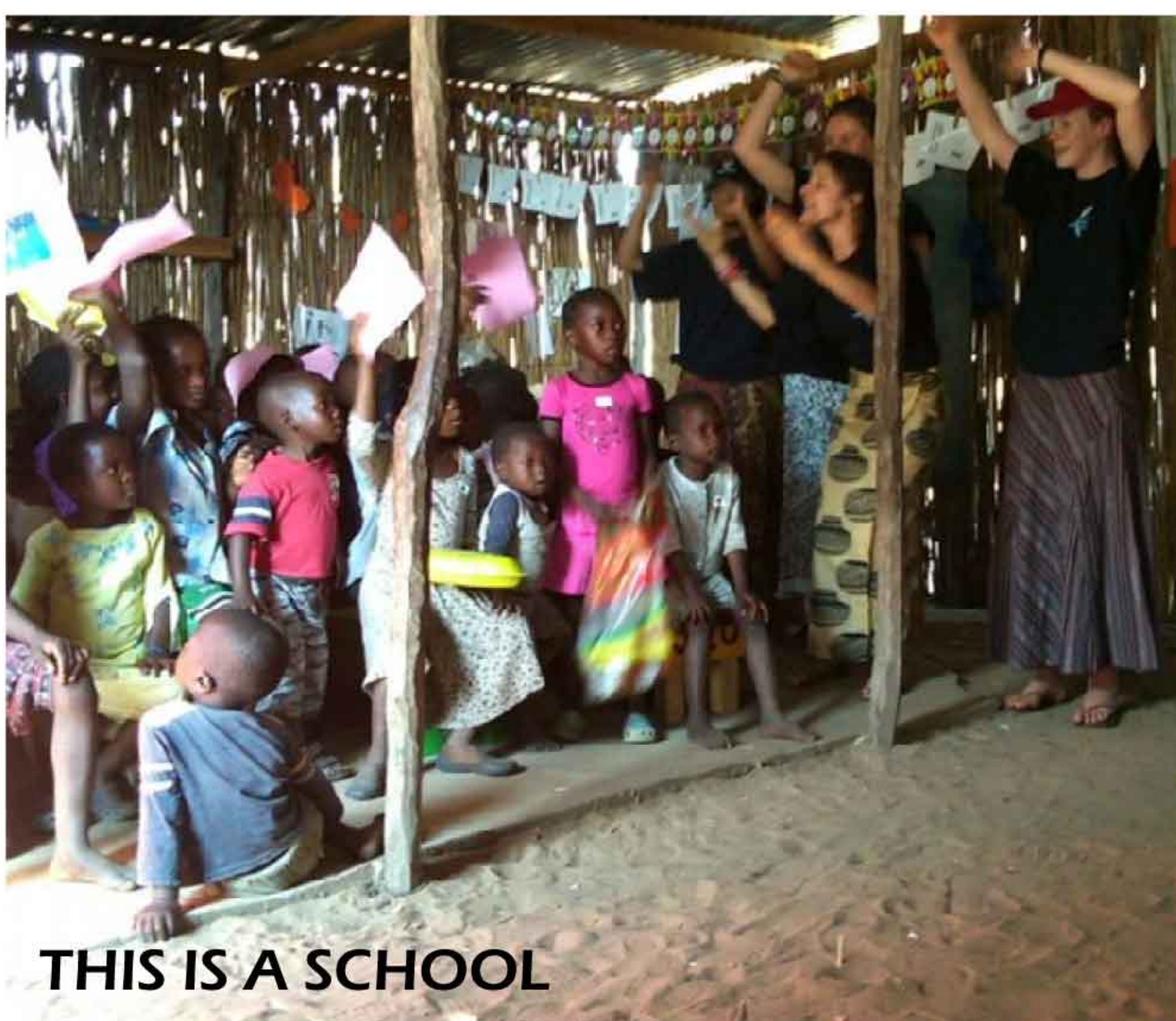
THIS IS A SCHOOL